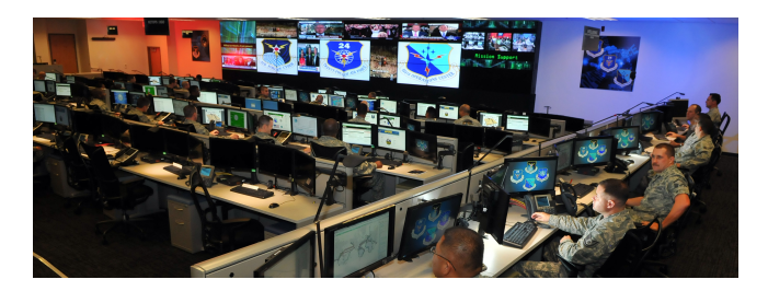
Fig. 1. A Security Operations Centre (SOC) [35]

The objective of a SOC is primarily to mitigate cybersecurity threats towards the organisations for which they are responsible [42]. Internal SOCs are responsible for the organisations they are placed within, while multitenanted SOCs monitor network security on behalf of multiple client organisations. Figure II-A is an example of a SOC, with security data presented to security practitioners on computer monitors. Practitioners are frequently required to work long shifts, including night shifts, looking at multiple screens for extended time periods [40]. The resulting pressure and demanding nature of SOC work have been highlighted in HCI research [39], [40].